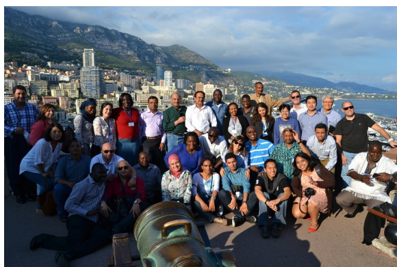
Participants visited the Riviera in Monaco.

The most useful topic identified by the GIS officers was: authority and responsibility of states: nationality, admission, stay detention, and expulsion.