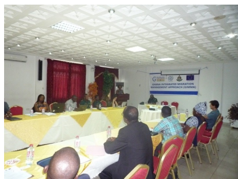
The plenary session of the TWG.

The TWG meeting was attended by a variety of stakeholders including Centre for Migration Studies, Bank of Ghana, National Identification Authority, Ministry of Employment and Labour Relations, Ministry of Foreign Affairs and Regional Integration, Ghana Tourism Authority, National Population Council, UNHCR and the EU.