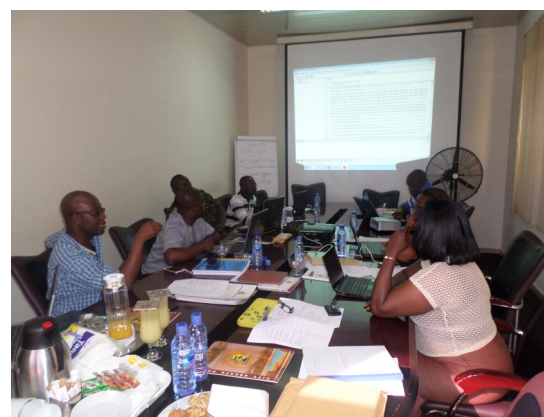
GIS officers review legal documents.

The legal handbook to be developed will serve as a compass for GIS staff on the implementation of immigration laws.