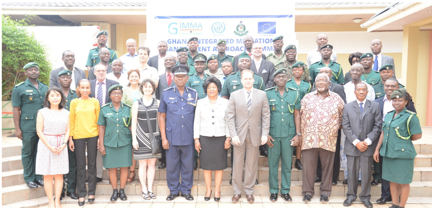
Attendees of the official launch ceremony for GIMMA.

The European Union is supporting GIMMA with three million Euros to complement Government of Ghana's efforts to manage migration effectively. The three year project (2014 - 2017) has three main objectives (capacity building, information outreach, migration data management) and is implemented in support of the draft National Migration Policy and GIS Strategic Plan.