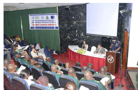
GIS Director delivers opening remarks.