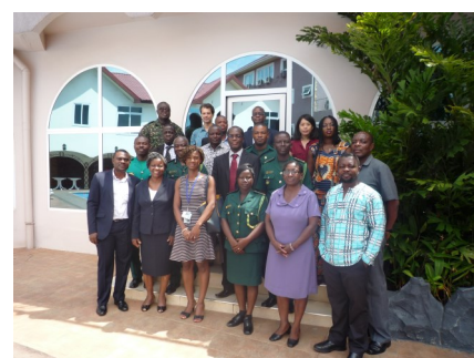
Technical Working Group Members.

In the second session, participants discussed the different types of migration data their institutions have and how data is shared.