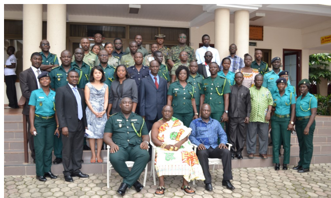
GIS officers and stakeholders gathered in Sunyani.

In the plenary discussion session, participants provided many recommendations for the MCC. The target group of the MCC should be the youth, as unemployed youth and youth in farming areas often see irregular migration as the only alternative to be successful in life. It was also suggested that the MCC should engage a wide range of actors ranging from travel agencies to the media. Additionally, the MCC should be located outside of the Ministry/GIS area to encourage visits from all potential migrants. The meeting ended with the closing remarks of COI Faisal Disu.