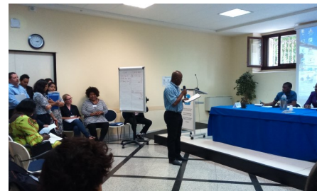
ADI Laud Affrifah acting as a lawyer appeals to the court to defend refugee's asylum applications.

The training session included other interesting topics such as law of the sea, climate change and migration, migration and business. Those topics could be further discussed within the context of Ghana.