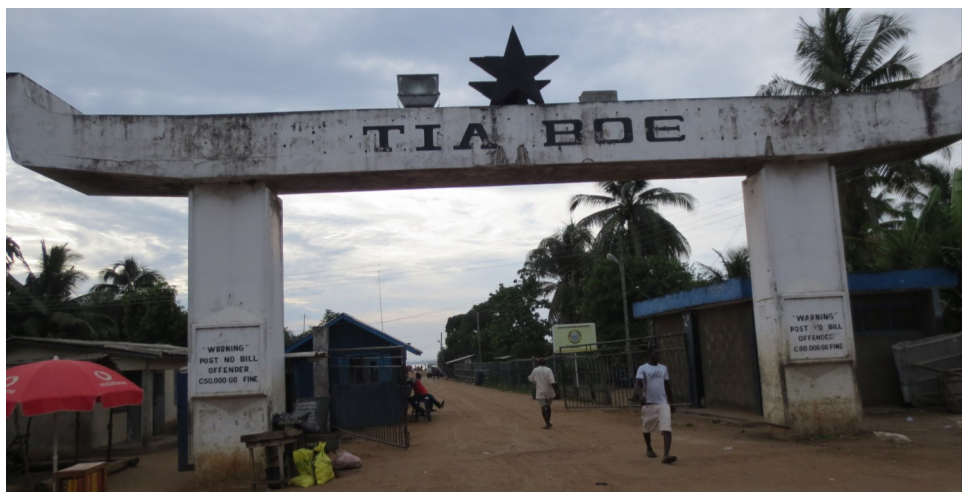
A border post in Ghana

Thank you most sincerely for offering me this platform to share a few thoughts with all who may have the opportunity to read this message.