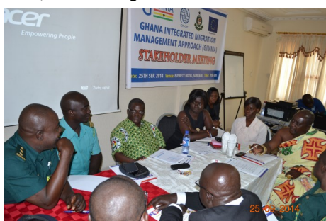
Participants discuss recommendations for the MCC.