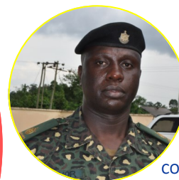
COI Justice Amevor FP for: ISATS